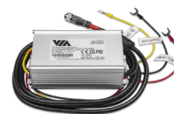
EV Power Converter