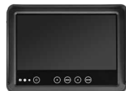
7" Display Panel